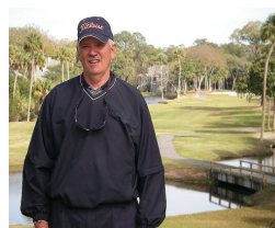
PA Pournelle 2007 Champion