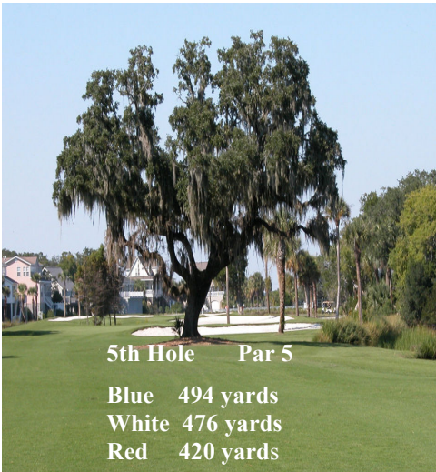
5th Hole Par 5

Blue 494 yards White 476 yards Red 420 yards